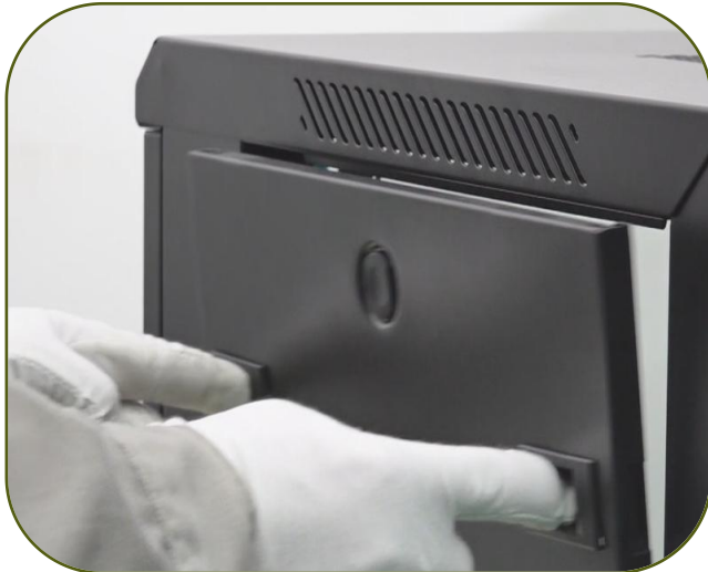
Removable side panels