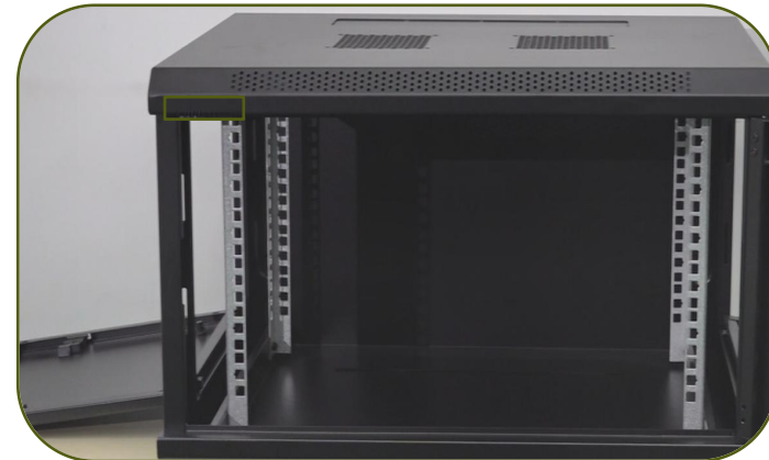
Inner part of the cabinet